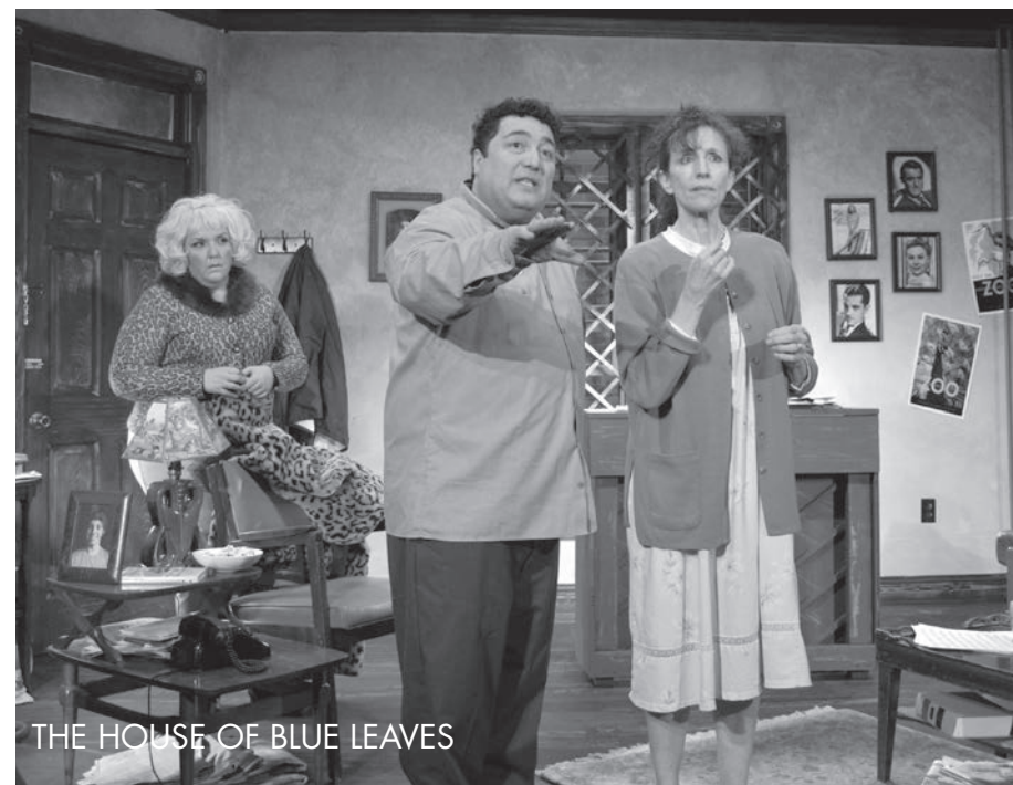
THE HOUSE OF BLUE LEAVES