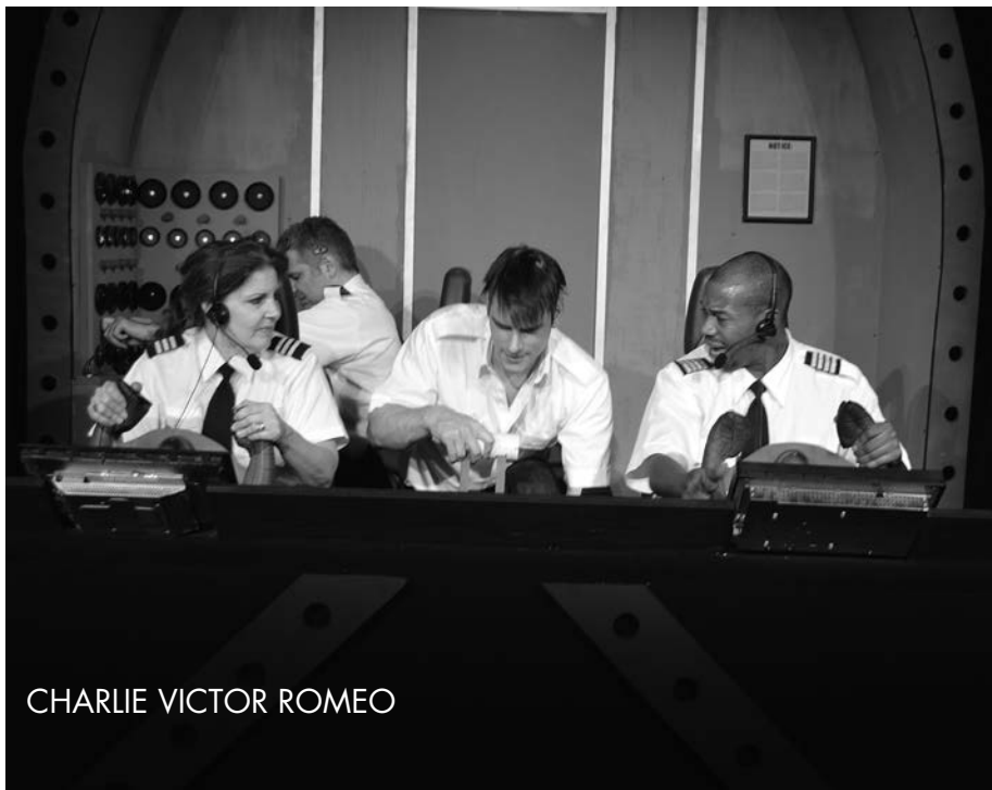
CHARLIE VICTOR ROMEO