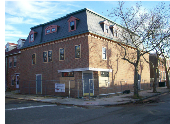
Camden's "Off-Broadway" Theatre THE NEW WATERFRONT SOUTH THEATRE NEARING COMPLETION

Be A Part Of Camden's New Waterfront South Theatre Grand Opening!